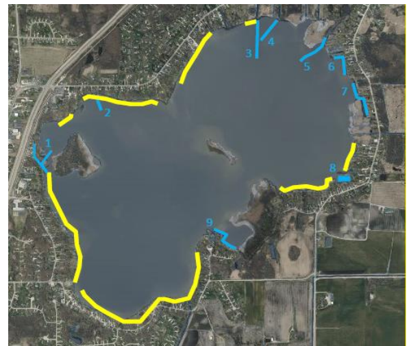
Wind Lake – Racine County, WI

The plants that are targeted for treatment include milfoil, curly leaf, SSW and filamentous algae. Occasionally, native plants are treated, but only if they are blocking navigation areas. DNR has the final say in all treatment areas for chemical control and may deny the treatment of specific areas. To the right is a map of the proposed areas of treatment.