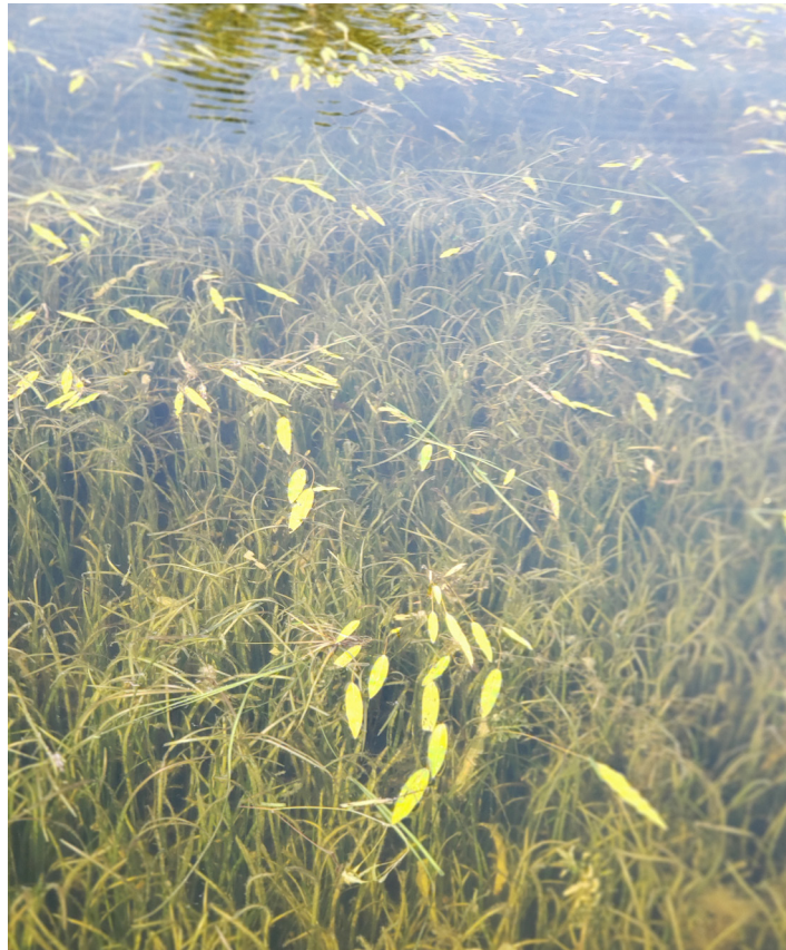
Good: Wild Celery and Pondweeds

Photo taken 7-27-19 on SW shoreline 4 feet deep