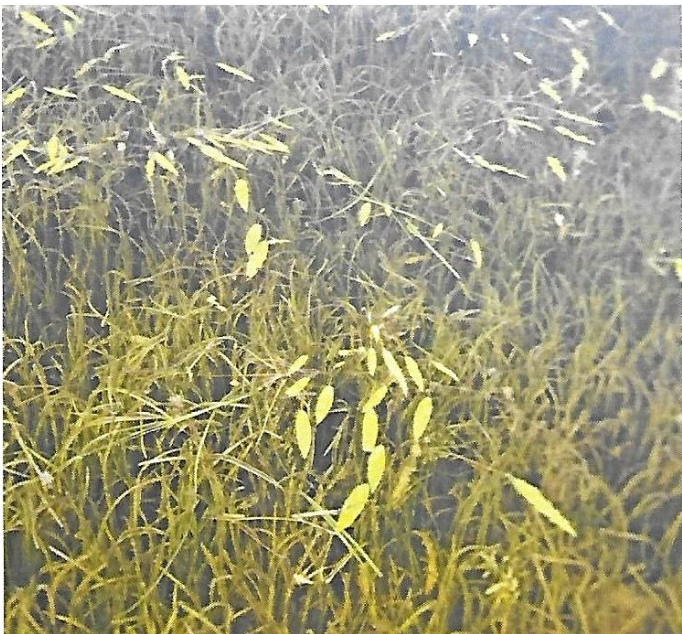
GOOD: Wild Celery and Pond Weeds

Good weeds, in general, are less dense, have a thinner architecture, and often can be boated through. Native weed beds are great for the fisheries. Invasive species weed beds are generally very dense and can quickly block boat traffic. Dense, monotypic stands of invasives negatively affect the fisheries.