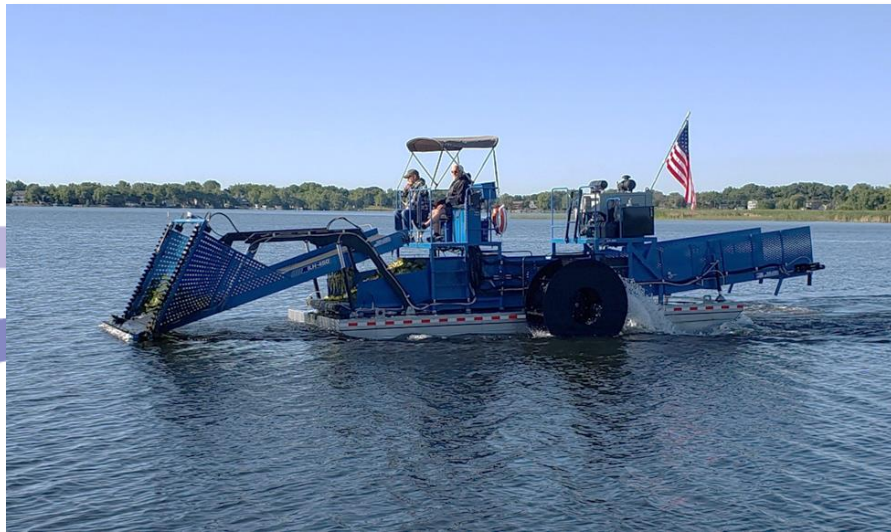
Harvesting operations began the week of June 21 st and will continue through the end of August.

Before the meeting, the new weed harvester will be available for viewing in the parking lot at 5:30pm. There will be a brief ceremony at 6pm, followed immediately by a group picture of all present. This is your chance to see the harvester and trailer up close! Even with the low lake levels this summer, her inaugural year has been a huge success. Come celebrate with her crew and be a part of history!