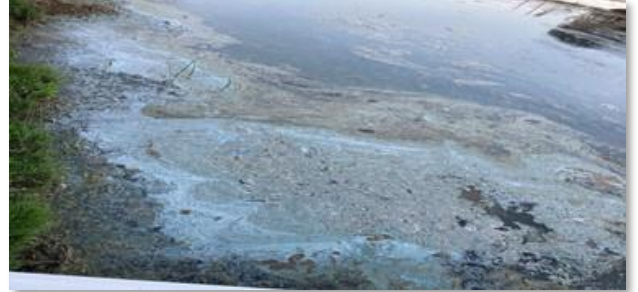
Blue Algae