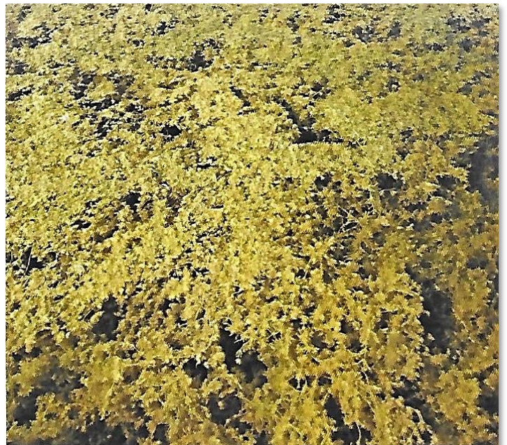
BAD: Starry Stonewort and Filamentous Algae