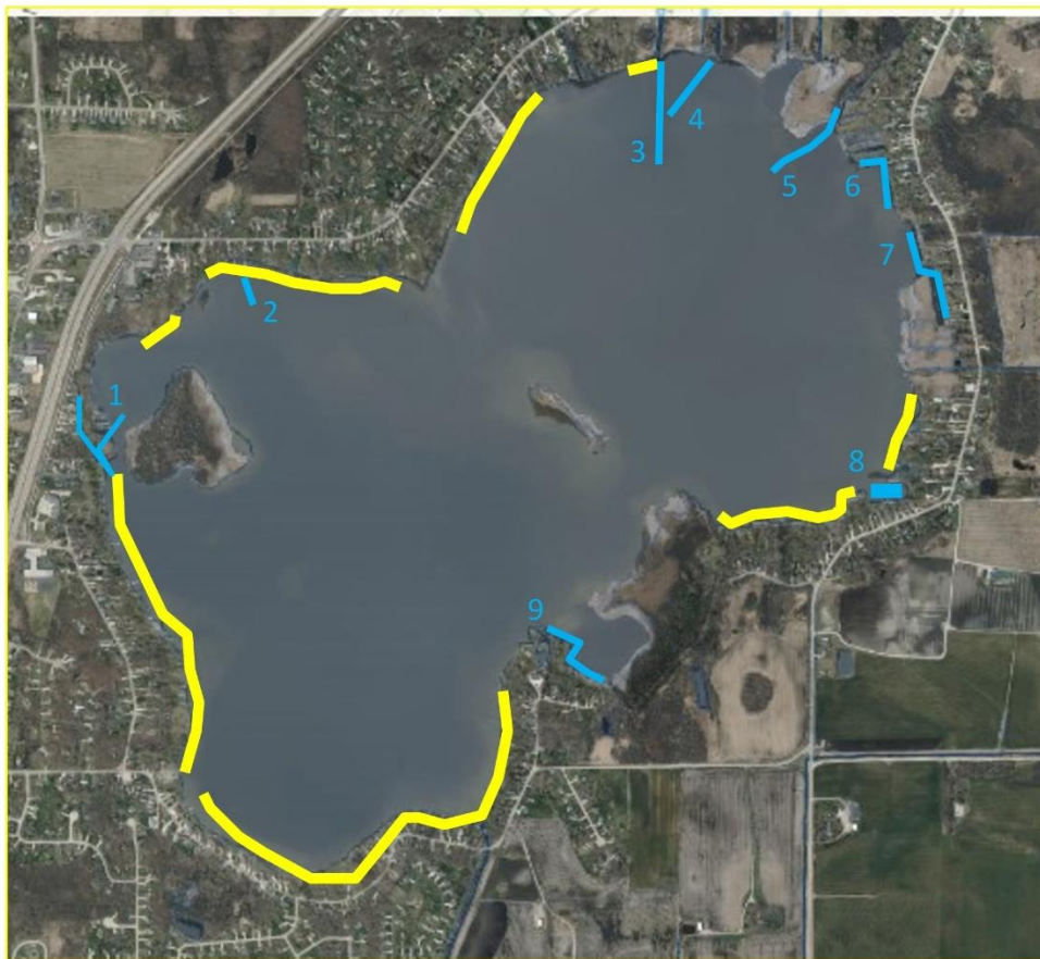
Wind Lake—Racine Co., WI 2022 Proposed Treatment Areas*

We have applied Starry Stonewort treatments in the navigational channel and applied larger chemical treatments in other parts of the lake for invasive growth. All treatments are done under the supervision of the DNR. We concentrate most of our treatments on navigational areas. Treatments can only be conducted when either invasive species are present or when nuisance conditions block lake use. Treatments have been made on June 7 th , 9 th , 17 th , and July 14 th . The map below shows the areas that have been treated: